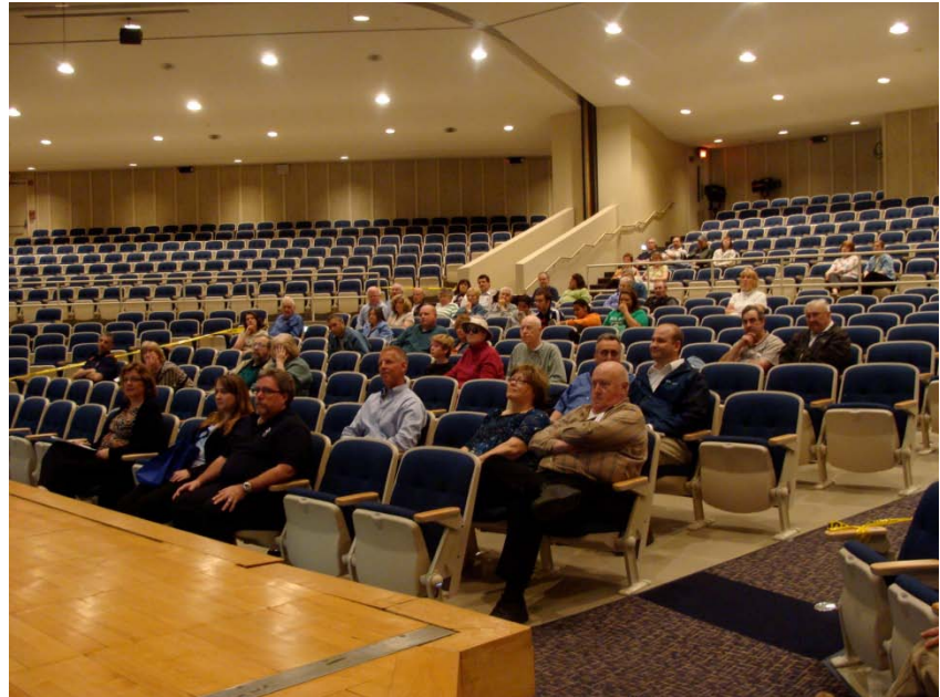
Audience listening to the presentations.