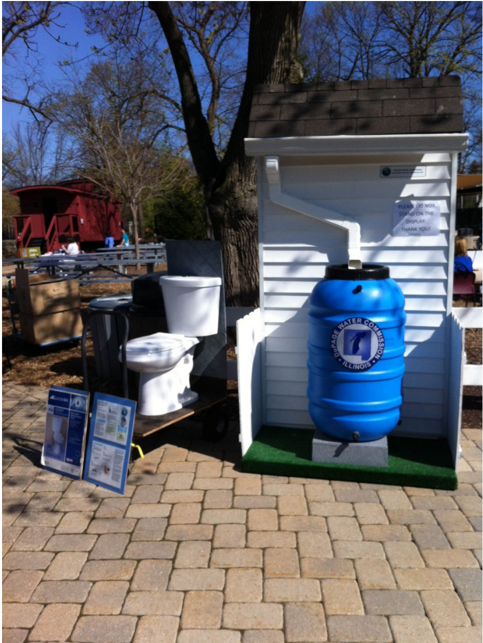
Preserving Every Drop dual flush toilet and rain barrel display